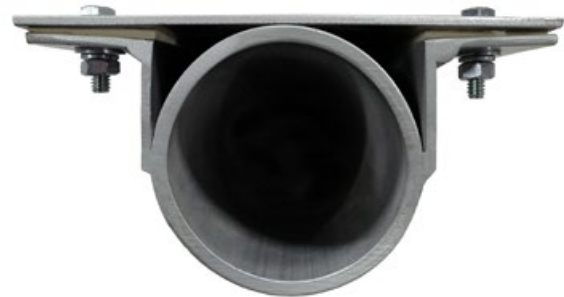
Cross Section of Elbow

Available in plain ends, flanged ends, grooved ends, or other specified ends. Special orders are welcome.